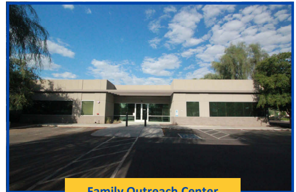
Family Outreach Center