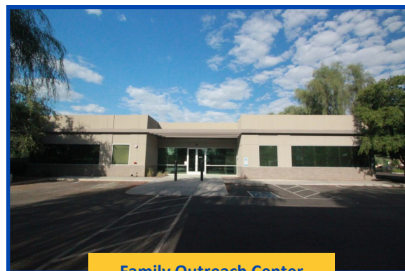
Family Outreach Center